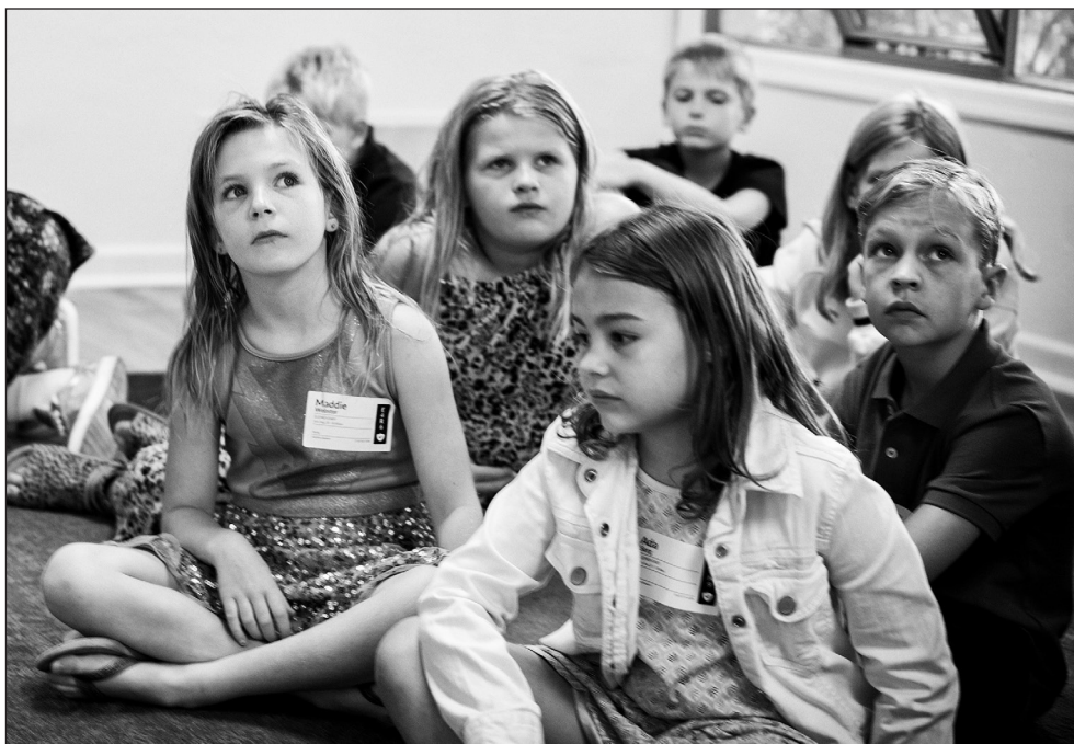
Elementary students listen intently during NextGen class.