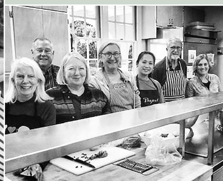
Meal prep for a CityTeam lunch took place in the church's kitchen while CityTeam's kitchen was temporarily closed.