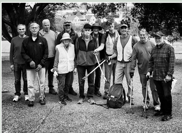
A dedicated group of church volunteers pose for a quick photo while picking up trash in Oakland.

We are excited to explore all aspects of our faith journey and look forward to all that this coming year brings.