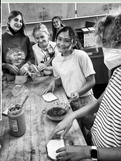
Students prepare sack lunches for the homeless.